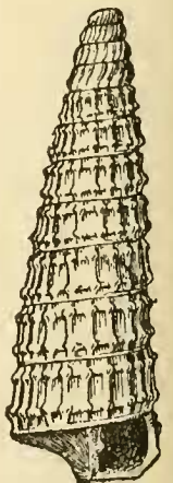
FIG. 2.—EUMETA BIMARGINATA C. B. ADAMS.

Shell elongate-conic, wax-yellow, except the posterior row of tubercles, which are light brown. Nuclear whorls four and one-half; the first half turn smooth; the remainder well rounded, separated by a constricted suture, marked by curved, quite regular, slender, distantly spaced, axial riblets, of which 16 occur upon the second, 18 upon the third, and 20 upon the last turn. Post-nuclear whorls concave in the middle, marked by two spiral cords, the first of which is at some little distance anterior to the summit, leaving a narrow, plain band at the summit, while the other is equally remote from the suture, the space between the two being about double the width of the spiral cord and the plain space at the summit. In addition to the spiral cords, the whorls are marked by well-rounded axial ribs which are very feeble posterior to the spiral cord at the summit. Of these ribs, 18 occur upon the first to third, 20 upon the fourth and fifth, 22 upon the sixth and seventh, and 24 upon the penultimate turn. These ribs are expanded where they meet the spiral cords, forming well developed tubercles at their junction. The spaces inclosed between the spiral